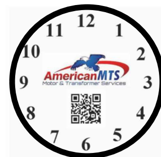
Shaft rotation sticker