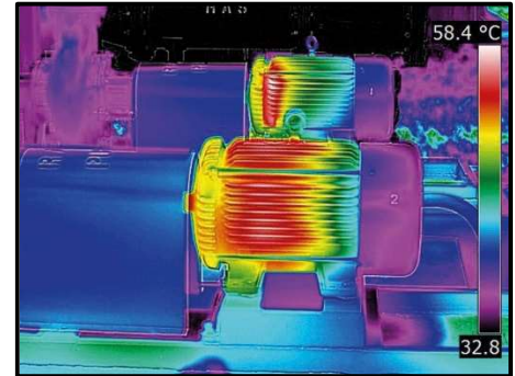
ASME Study Of Maintenance Costs

Your plant depends on equipment being available when needed. Unfortunately from the day first installed it is starting to fail. Not knowing when can be both stressful and costly. Implementing a predictive maintenance program will give you the data needed to catch things at early stages of failure.